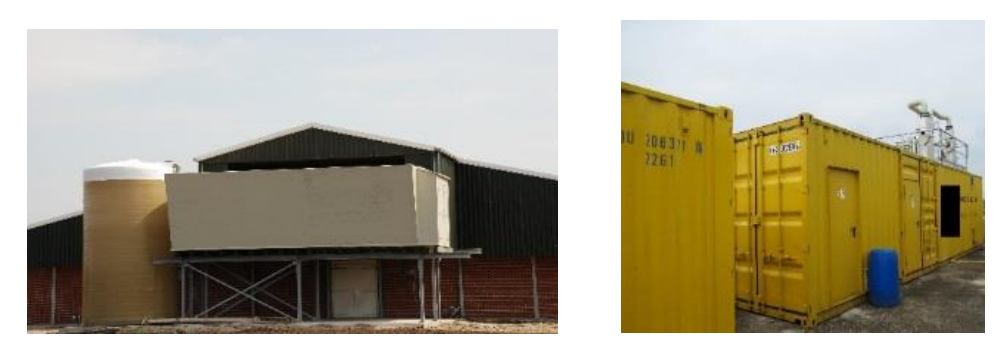
Photo 1: air scrubber (left) and ammonia stripping / scrubbing installation (right)