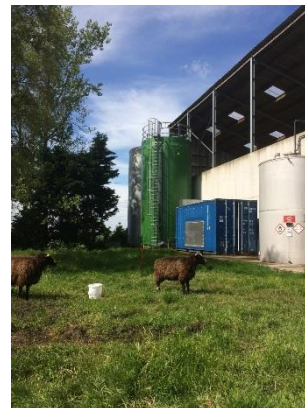
Photo 1. N-stripper/scrubber into ammonium nitrate (© Detricon installation)