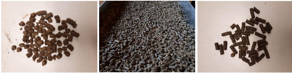
Figure 2 Pellets made of dried grass (f.l.t.r. 35%, 30% and 25% moisture)

moisture content of ca. 35%. However, using these pellets require a drying step, after the pellets were made to prevent the pellets from rotting (mold formation).