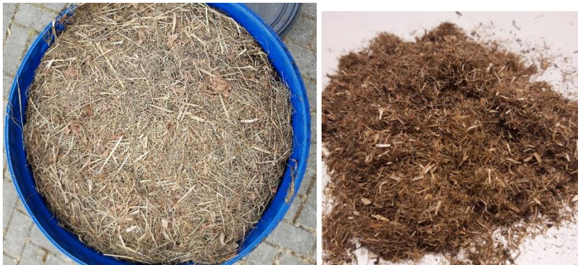
Figure 1 Dried grass (left) and reduced grass fibres (right)

Fresh, dried and refined roadside grass clippings have been received via Pro Natura / Innec in blue tons (see Figure 1). The fresh grass clipping had a moisture content of 55%. The dried grass clippings had a moisture content of 30%, and refined grass clippings had a moisture content of 50%. The received grass samples contained a lot of sand (+/- 24% of ash), stones, plastic, metal and other pollutants. Therefore, it was decided to wash the grass samples first before processing them further. The grass was washed until an ash content of +/-14%, and pollutants were taken out. After washing the grass is dried until +/- 80% dry matter. The grass fibres were too big for grass pellet production, and therefore, the different grass samples were further processed using a hammermill with a sieve of 2 mm.