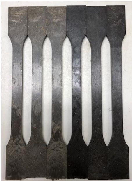
Figure 4 Tensile bars with dried grass pellets (f.l.t.r. fibre, grinded pellet, pellet in recycled HDPE and fibre, grinded pellet, pellet in PLA)

Tensile bars were processed using dried grass fibre, grinded dried grass pellets, and dried grass pellets made with 35% moisture compounds using ca. 35-40% grass fibres (see Figure 4). The dried grass pellets were processed into 6 different compounds using recycled HDPE and PLA. Injection moulding of the tensile bars, in case of recycled HDPE went without problems, whereas in case of PLA it went somewhat harder. Processing temperature had to be raised to 185-200°C, and the remaining cooling time had to be increased to 40 seconds. This resulted in somewhat darker tensile bars in case PLA was used. After conditioning, these test bars were analysed on mechanical properties.