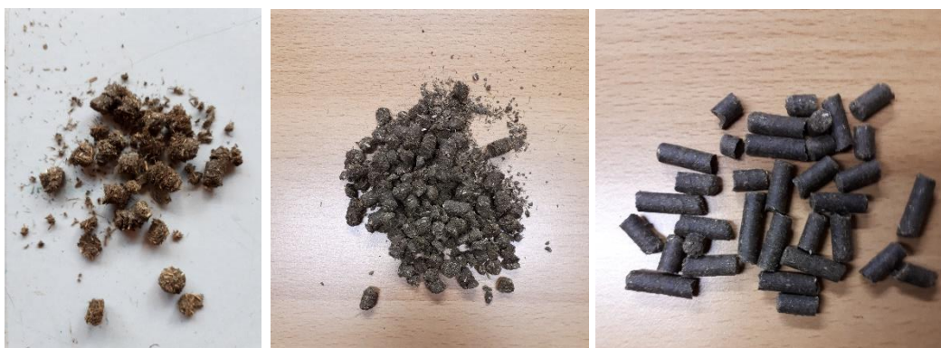
Figure 3 Pellets made of refined grass (f.l.t.r. 35%, 32% and 25% moisture)

Furthermore, cleaned sized dried refined grass was processed into grass pellets, using quite the same conditions as with the previous experiments. Pellets were made with a dry matter content of 68% and 75%. Using a moisture content of 65% didn't results in pellets, due to the fact of too little structure left in the grass pellets (easily falling apart). This can be seen in Figure 3.