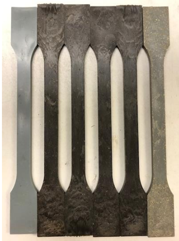
Figure 5 Tensile bars with refined grass (f.l.t.r. recycled 100% HDPE, composite with loose fibres, composite with grinded pellets 25% moisture, composite with pellets 32% moisture, composite with grinded pellets 32% moisture, and composite with wood fibres)